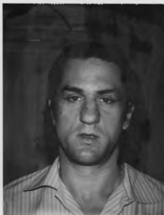
La Motta nose tip small bridge medium eyes cotton both nostrils