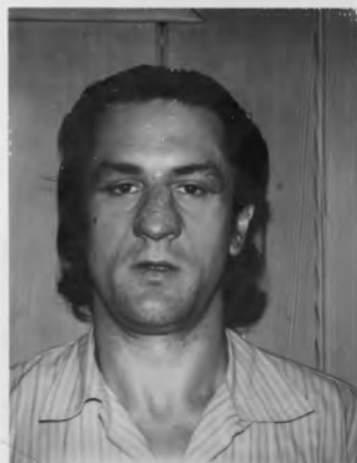
#5 tip on right side cotton both nostrils small bridge