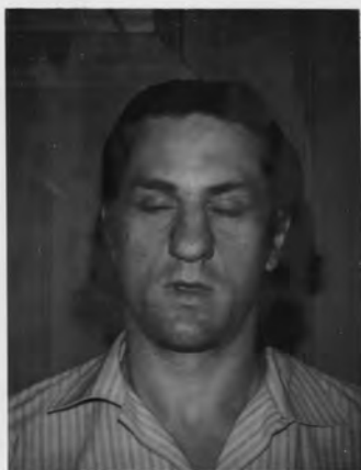
La Motta nose tip small bridge medium eyes cotton both nostrils