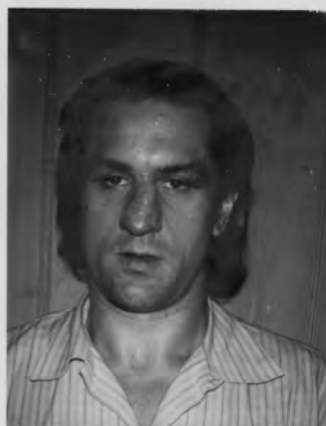
#5 tip on right side cotton right side facing camera small bridge

Test polaroids of De Niro as he tries to perfect La Motta's look by stuffing cotton in his nostrils. This page is one of dozens of make-up tests, all of which attest to De Niro's obsessive devotion to minute details. Images courtesy of The Robert De Niro Collection, The Harry Ransom Humanities Research Center, The University of Texas at Austin.